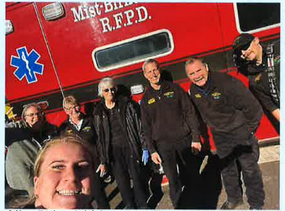
Mist-Birkenfeld Staff & Volunteer Chief Officers

Ambulance Service Area Franchise Request For Proposal - ASA 6