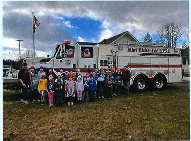
Mist-Birkenfeld RFPD participating in a holiday activity at the local Mist Elementary School.

Ambulance Service Area Franchise Request For Proposal - ASA 6