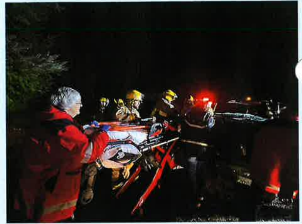
Mist-Birkenfeld Staff & Volunteers practice patient extrication techniques in a simulated motor vehicle accident with entrapment. All of our response staff and many volunteers are cross-trained as both Firefighters and EMS personnel.