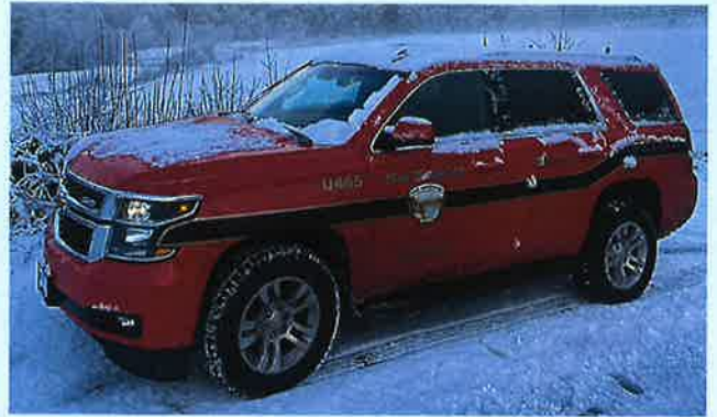
Utility 465, a non-transport capable Quick Response Unit owned by Mist-Birkenfeld RFPD. This unit is assigned to a staff member who takes it home after shift and includes vital equipment such as an AED, first-line medications and more to help deliver life-saving interventions quickly while waiting for the ambulance.