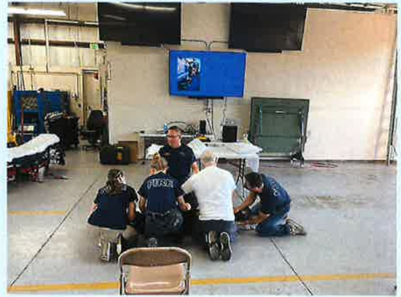
Mist-Birkenfeld Volunteers train on safe patient handling and movement techniques - provider safety is very important in providing great patient care!

Ambulance Service Area Franchise Request For Proposal - ASA 6