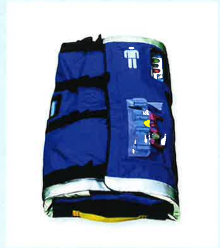
A ZOLL AutoPulse mechanical CPR Device. We have these devices located on both ambulances to assist in sudden cardiac arrest patients.

Ambulance Service Area Franchise Request For Proposal - ASA 6