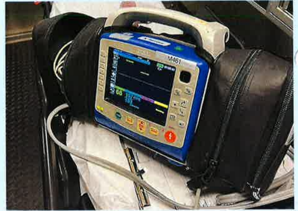
A ZOLL X-Series Cardiac Monitor on Medic 461. Mist-Birkenfeld has three units - one for each ambulance and one for our Paramedic staff member's Quick Response Unit.