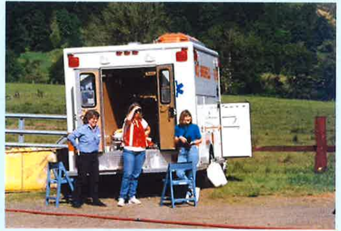
A former Mist-Birkenfeld Medic Unit with some of our volunteers standing by for response. Picture date estimated early 1990s.

During that period the Mist-Birkenfeld Quick Response, having recognized how similar their mission was to that of the fire district, joined with Mist-Birkenfeld RFPD. In order to maintain functional integrity the district created two operational divisions: Fire Suppression and Emergency Medical Service. By mid-1983, after all of the new equipment had arrived, the EMS division worked with eight fully trained and certified EMT's, while trained and active firefighters had dwindled to seven.