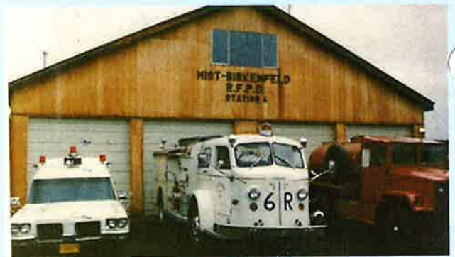
The original Station 6 in Mist, Oregon, that was built in 1980 and eventually was flooded in 1996. Thanks to the hard work of staff, volunteers and a grant from FEMA, a new Main Station was built on Highway 202.

Ambulance Service Area Franchise Request For Proposal - ASA 6