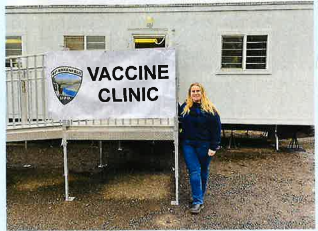
Despite a limited budget, Mist-Birkenfeld RFPD works hard to find creative funding opportunities to offer value-added services, such as vaccine clinics, for our District Members & surrounding communities.