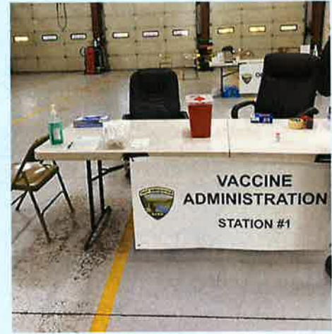
A Vaccine Administration Station during the COVID-19 Pandemic at the Mist-Birkenfeld Main Station in Mist, Oregon.

Ambulance Service Area Franchise Request For Proposal - ASA 6